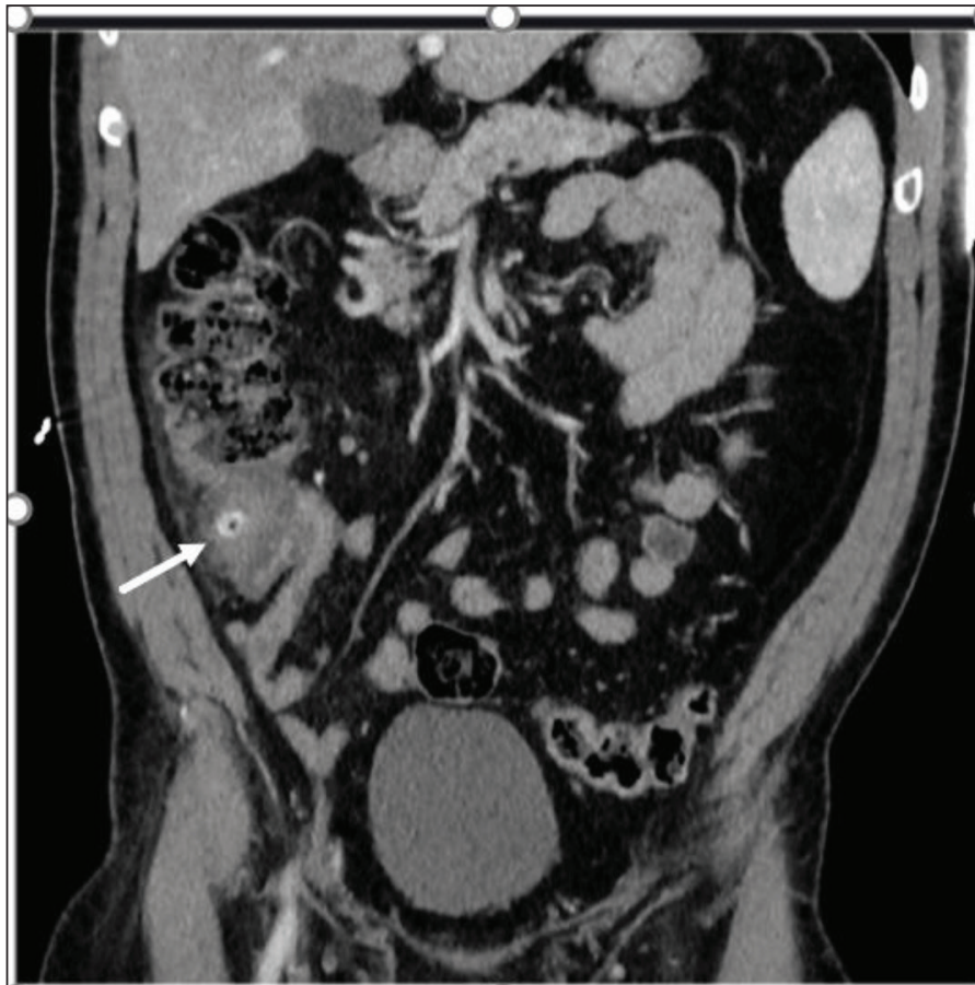
Figure 3. Coronal view demonstrating mild reactive mural thickening at the base of the appendix (arrow) adjacent to the inflamed cecum.