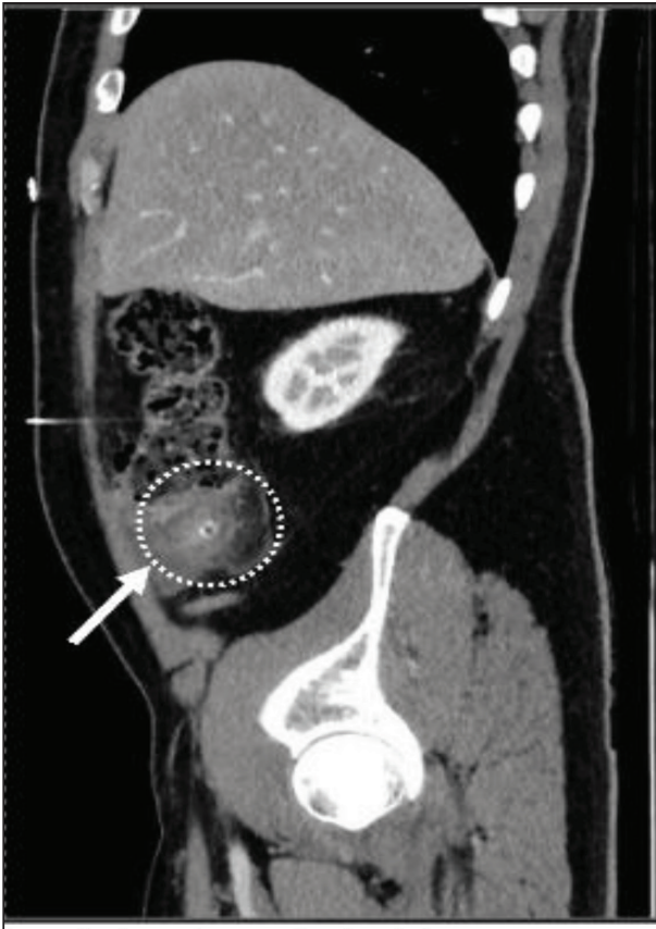
Figure 4. Sagittal view confirming inflammatory changes confined to the cecum without evidence of perforation, abscess, or free intraperitoneal air.

This case contributes to the limited literature describing cecal diverticulitis in older patients and highlights the importance of considering this diagnosis even when patient age, pain location, or comorbidities are atypical.